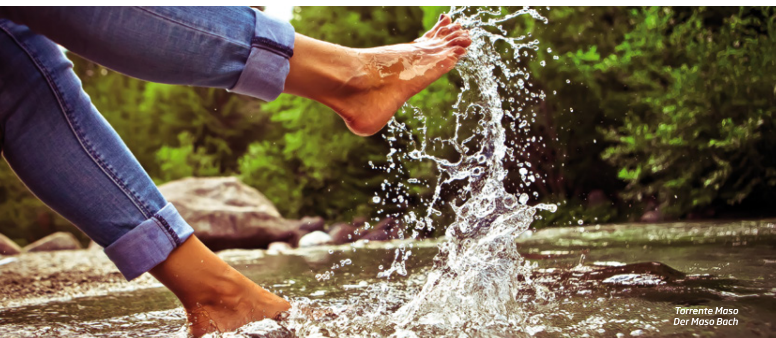
Torrente Maso Der Maso Bach

Loc. Desene - 38050 Ronchi Valsugana Cell. +39 349 0844709 chalet.serena@gmail.com www.chaletserena.com