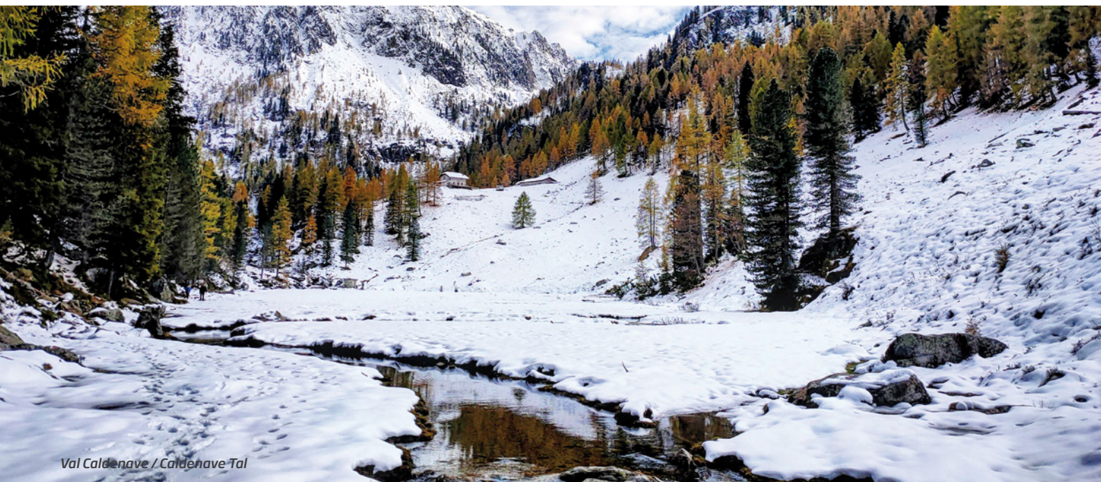
Val Caldenave / Caldenave Tal

Altitudine 1792 m slm Località Caldenave - 38050 Scurelle Cell. +39 340 6351259 rifugio.caldenave@gmail.com mountbnb.com/it/452/rifugio-caldenave-4