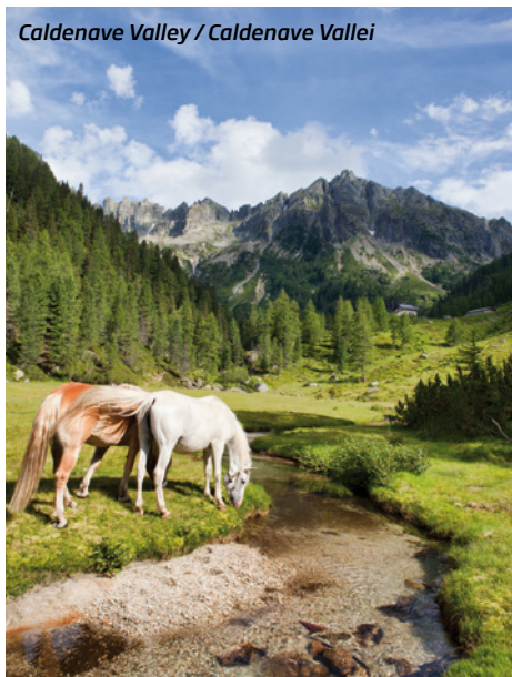
Caldenave Valley / Caldenave Valle